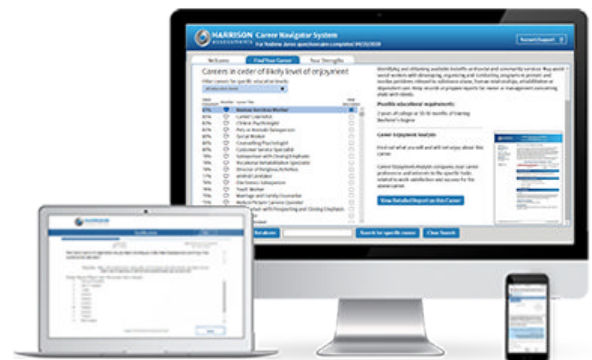
Online Interactive Career Portal